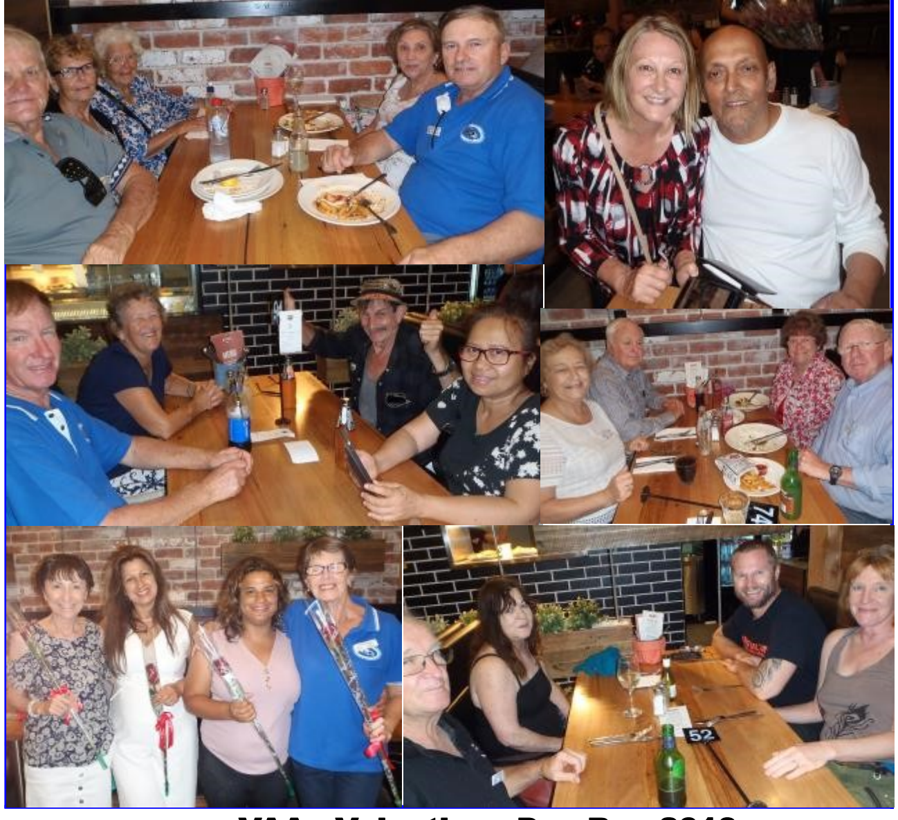
VAA - Valentines Day Run 2019

Facebook https://www.facebook.com/groups/Vaawa/